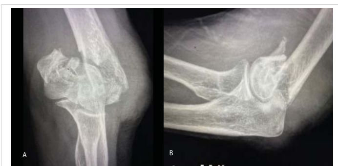
Figure 1: A and B: Demonstrates PA and Lateral injury radiographs of the patient.

Various treatment options have been used to address fractures of the distal humerus in the elderly population as far back as the 1940 s and 1950 s including non-operative treatment, which involves immobilization and range of motion to restore function [8-10]. Operative treatments include open reduction and internal fixation, which is the time and true gold standard for managing these injuries [5]. Total elbow