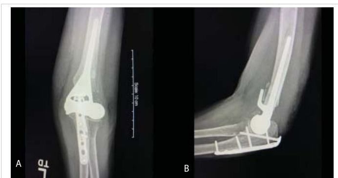
Figure 2: A and B: Are the radiographs 2 weeks after surgery.