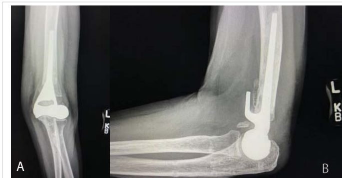
Figure 4: A and B: Radiographs at one-year post-op demonstrate the prosthesis is stable with no signs of loosening and the ulna chevron osteotomy is healed.

replacement is another consideration that is commonly used in elderly patients [6]. Arthrodesis and resection arthroplasty with or without facial (or other) interposition are salvage procedures that are rarely employed but may be a reasonable option in complex cases such as infection [11,12].